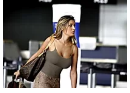
[Gallery] 28+ Unbelievable Photos Taken At The Airport