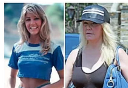
[Gallery] Heather Locklear: At 56 She Takes An Interesting Turn