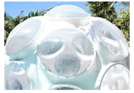
Why is everyone Instagramming this incredible sculpture?