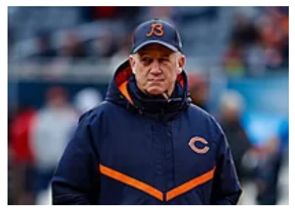
Head Coaches in the NFL That Might be Fired Soon