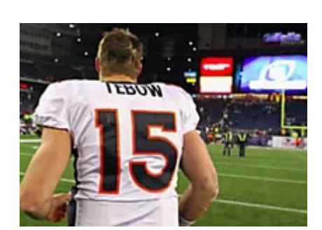
10 Weird NFL QB Record Holders